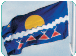
The new Tlicho flag

Whati is well known for its high quality dried fish and caribou, traditional hand games and drum dances.