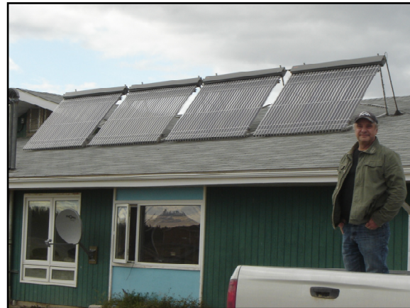
Figure 1 – SWH Tubes at Ft. Providence

The SWH System has successfully reduced both the cost of heating water at the Seniors' Center as well as reduced their Green House Gas emissions. As well the system has operated to date without any significant problems.